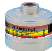
Combination Filter 93 ABEK2-Hg/St