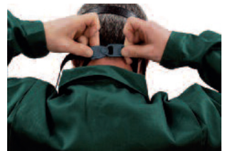
Close neck buckles and pull on both straps evenly