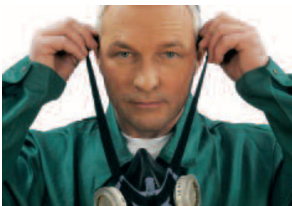
Place cradle on head