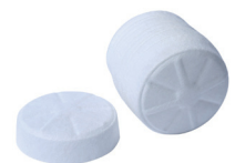
Pre-Filter for Filter Cartridge