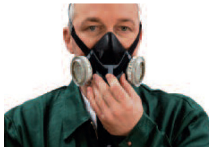
Pull down front straps and lock lever